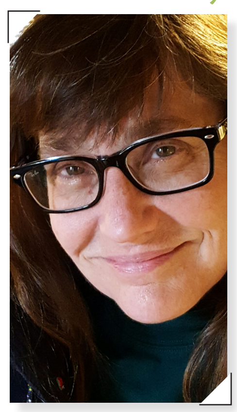
Could you describe your role as Community Care's Director of Behavioral Health?

I manage behavioral health services for all our programs — Family Care, Partnership, and PACE. I supervise 13 behavioral health specialists who assist our care teams. I work closely with our mental health nurse practitioner and our consulting psychiatrist. I also provide behavioral health consultation, psychotherapy, and lead our dementia care program at Community Care.